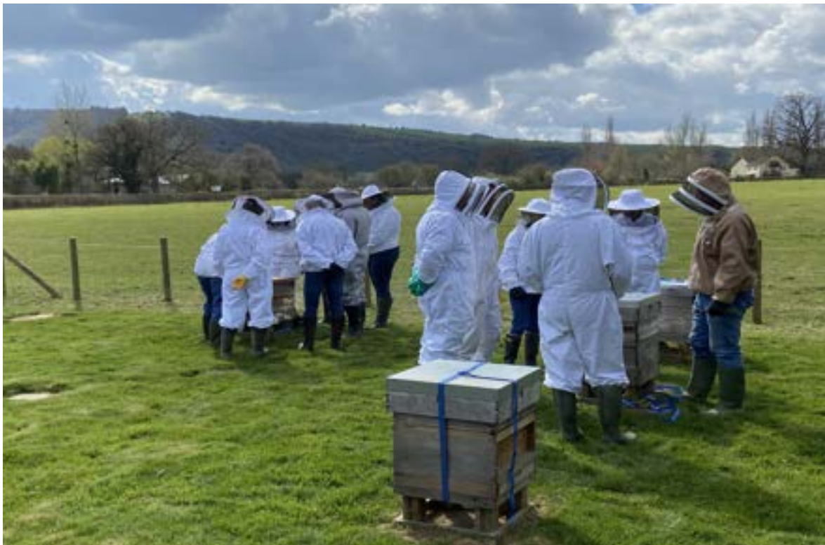
Students at North Dorset's Introductory Day get their first look inside a hive